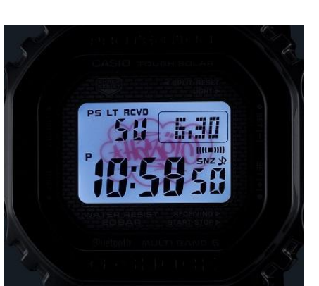
When light is activated