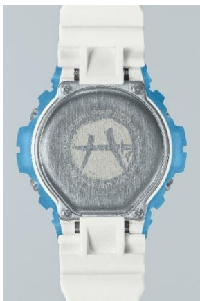
“Black Samurai” logo on case back