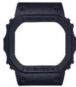
Remover tool and replaceable bezel