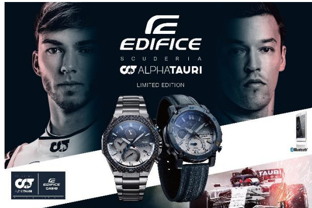
EQB-1100AT / ECB-20AT

Designs Feature White and Navy Blue Team Colors