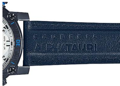
Team logo (ECB-20AT)