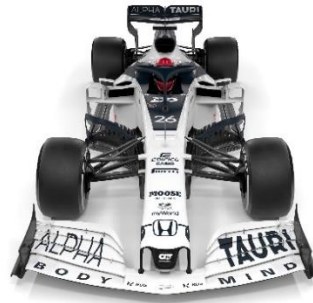
Scuderia AlphaTauri's F1 racing car